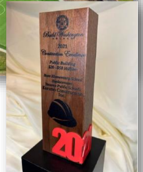
AGC “Build Washington” Awards 2021 Project of the Year